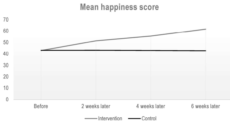
Fig. 2 Comparison of changes in the happiness score in the intervention and control groups

a After adjustment for demographic variables in GEE model